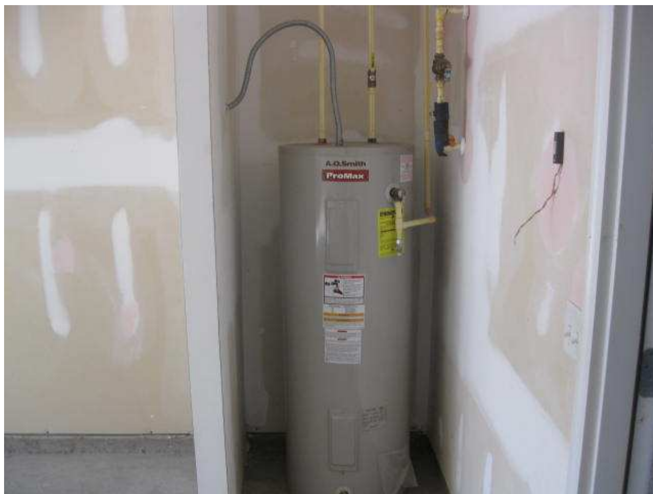
electric water heater.JPG

Emailed Pictures - 10/25/2011 3:52:55 PM - Harvey