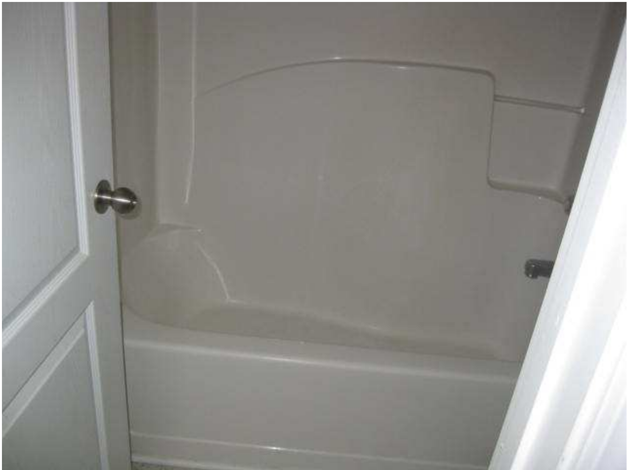
tub shared bath.JPG

Emailed Pictures - 10/25/2011 3:52:55 PM - Harvey