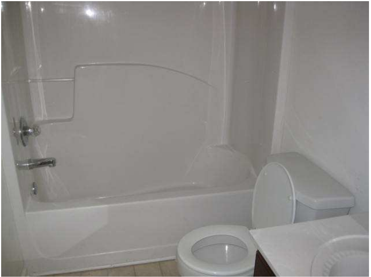
bath main level.JPG

Emailed Pictures - 10/25/2011 3:52:55 PM - Harvey