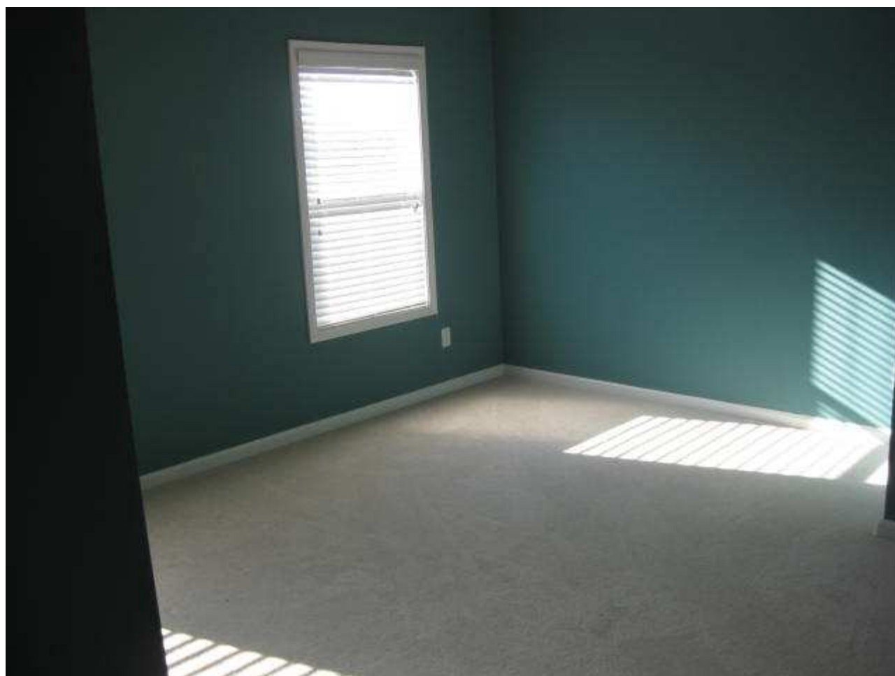
sitting area master bedroom.JPG

Emailed Pictures - 10/25/2011 3:52:55 PM - Harvey